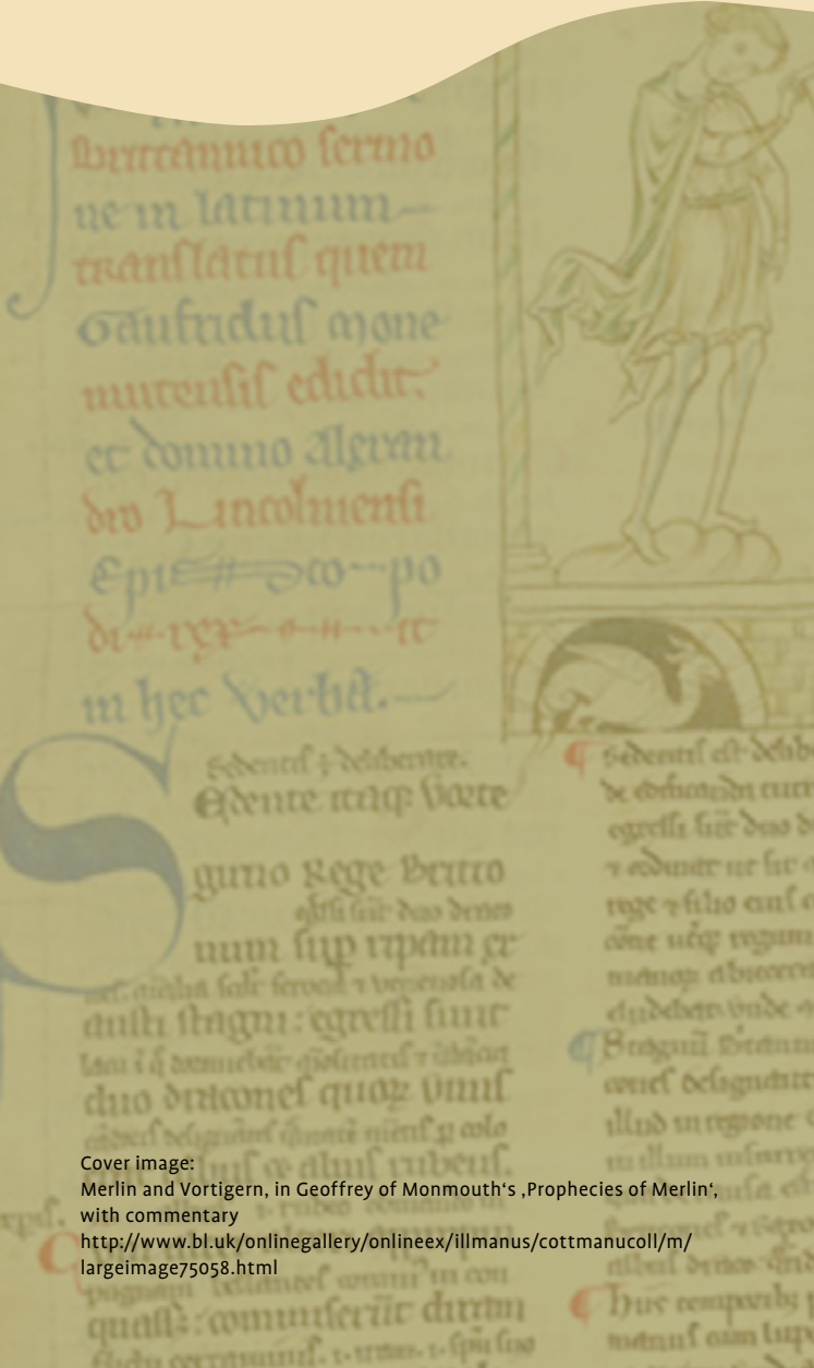
Cover image: Merlin and Vortigern, in Geoffrey of Monmouth's 'Prophecies of Merlin', with commentary http://www.bl.uk/onlinegallery/onlineex/illmanus/cottmanuoll/m/largeimage75058.html