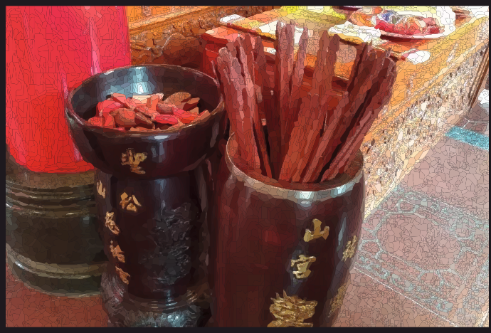
Fortune sticks and temple oracle (Mazu Temple, Taipei)